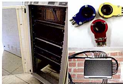
Monitoring Equipment & Sensors

An international Online Partial Discharge